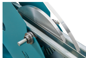
Simultaneous acceptance of two rolls of sheet metal