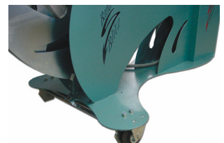
Mobile, thanks to integrated wheels